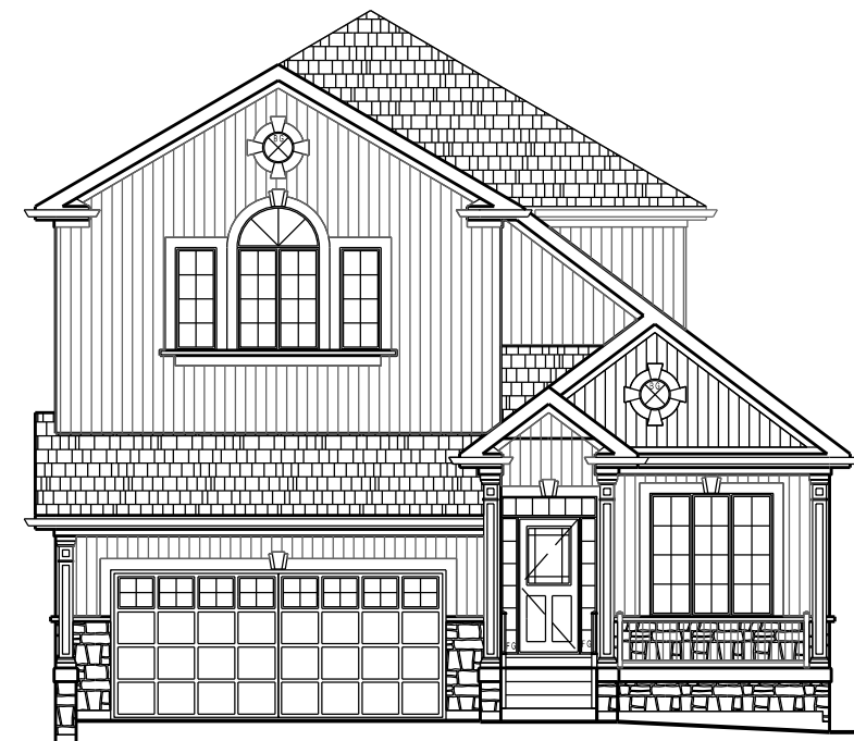
Front ( North )Elevation