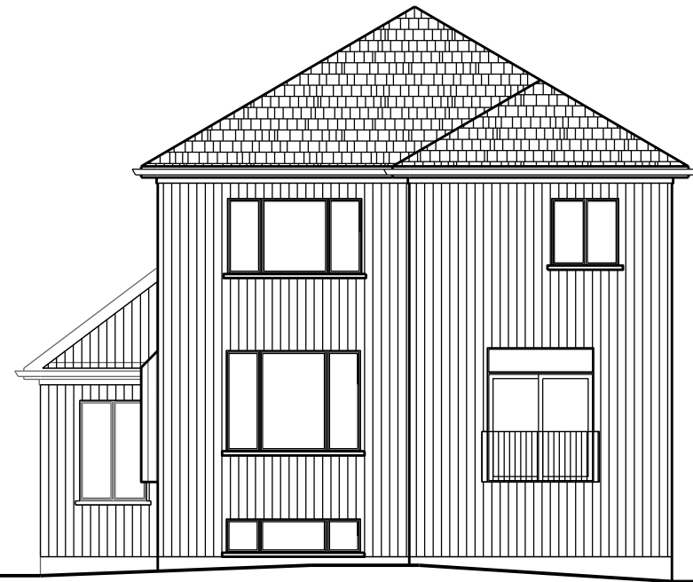
Rear ( South )Elevation